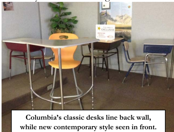
Columbia's classic desks line back wall, while new contemporary style seen in front.

Columbia Manufacturing Inc. has operated at its Westfield, Massachusetts facility since 1877, and currently has a workforce of 70 employees, during their peak season. The company transitioned from bicycle manufacturing to school furniture manufacturing, currently producing classic desks, tables, and chairs as well as contemporary, ergonomic and collaborative styles.