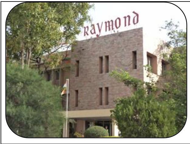
Raymond Limited Textile Division, Chhindwara -100 acres Plant

RAYMOND LIMITED with a 45.28 Million Meters in wool & wool-blended fabrics, Raymond commands over 60% market share in worsted suiting in India and ranks amongst the first three fully integrated manufacturers of worsted suiting in the world.