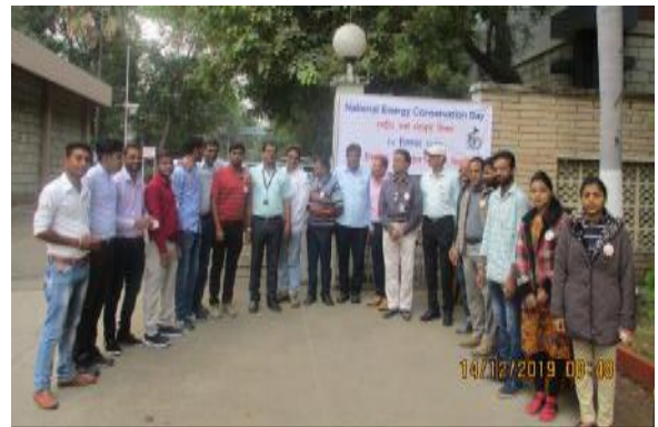
Energy Conservation day Dec.2019

Through the Energy Management Working Group (EMWG), government officials worldwide share best practices and leverage their collective knowledge and experience to create high-impact national programs that accelerate the use of energy management systems in industry and commercial buildings. The EMWG was launched in 2010 by the Clean Energy Ministerial (CEM) and International Partnership for Energy Efficiency Cooperation (IPEEC).