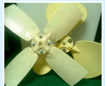
Fiber Reinforced Plastic Bladed Fans