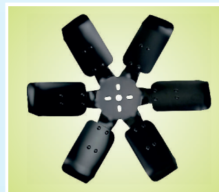
Metallic Bladed Fan