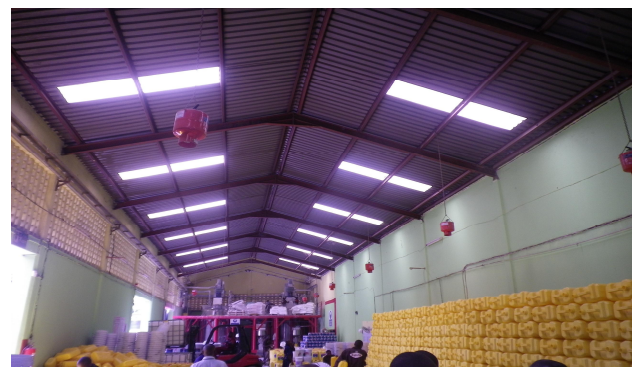
Production floor before and after installation of translucent sheets under RECP Implementation