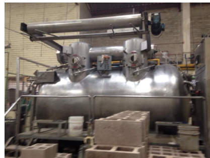
Dyeing process improved: Dyeing jet