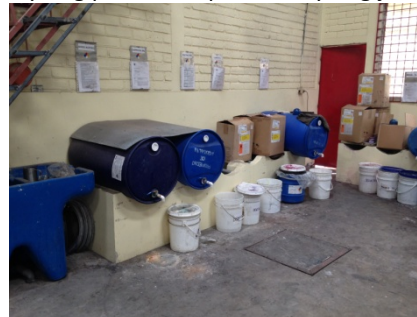
New chemical products placement