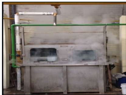
Old Dyeing Machines

In a simple glance is possible to see the improvements obtained in INCALSA on energy efficiency with the implementation of a Dyeing Jet System, because there not visual evidence of steam, water and pigments loses. Also the management of chemical products has improved as seen in the photographs.