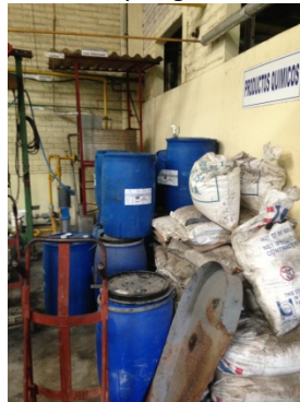
Old chemical products placement