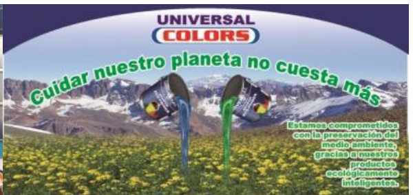
The ecological product line from Universal Colors