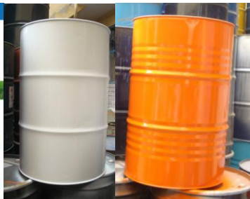
Tests with the new varnish