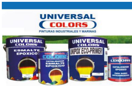
Universal Colors products

J & S Ferreteria Industrial (Universal Colors) was able to reduce its solvents consumption by 80% as a result of the RECP programme. New and more environmental friendly paints were developed through the substitution and reduction of hazard chemicals and solvents. RECP enabled the company to reduce solvent emissions, improve working conditions and access new markets.