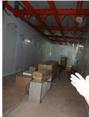
Figure 3 – Cooling chamber

The benefit gained by Installation of cooling chambers is to preserve meat, avoid contamination of meat and fulfil the requirements of inspection from the Ministry of Health and Agriculture on food safety and hygiene to ensure public health protection.