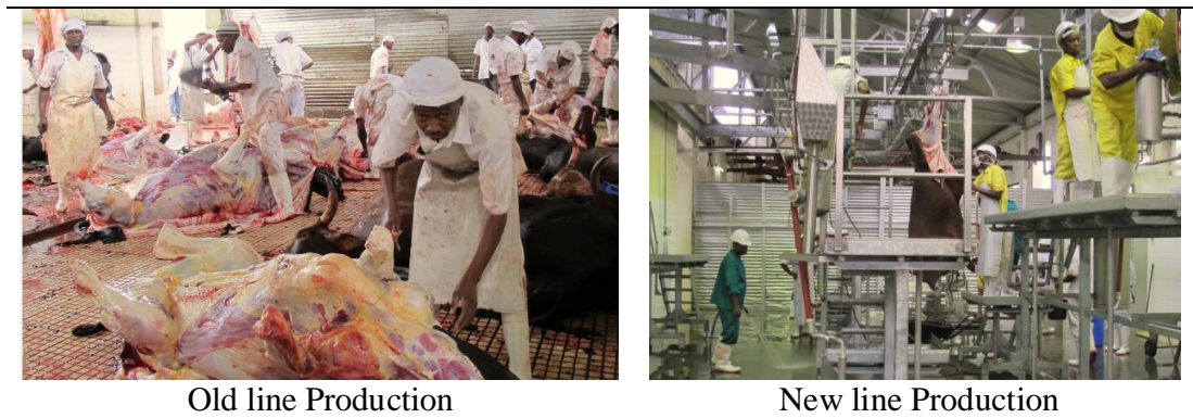
Figure 1 – Production Line

Improve the health and hygiene conditions. Increase efficiency and competitiveness reducing the risk of occupational accidents. Improvement of health conditions and worker safety, improvement of the company's image to the consumers, suppliers, public authorities, market and local community, improved relationship with environmental authorities and civil society.